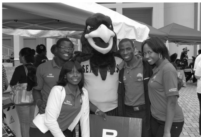
Broward College Mascot, Sammy the Seahawk, with students