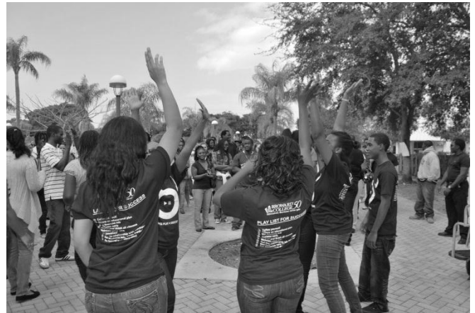
Student Activities at Broward College